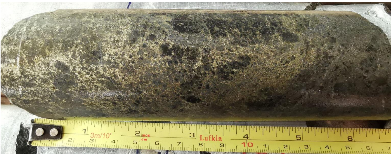
Figure 1 Exhalative Style massive sulphide with chalcopyrite and sphalerite from drill hole LO20-213

The eastern and western limbs of the fold host massive to semi-massive sulphides, primarily chalcopyrite and cream-coloured sphalerite mineralization dip steeply to the west. Mineralization in this area appears to have primarily formed at the seafloor as exhalative sulphides, as opposed to near-seafloor replacement or sulphide mounds at the other VMS deposits on Property. Massive and semi-massive sulphide mineralization encountered in this drilling program is commonly associated with exhalative iron oxide mineralization with silica, primarily magnetite with lesser hematite. The iron-formation will often host >1.0 g/t Au values with low base metal content.